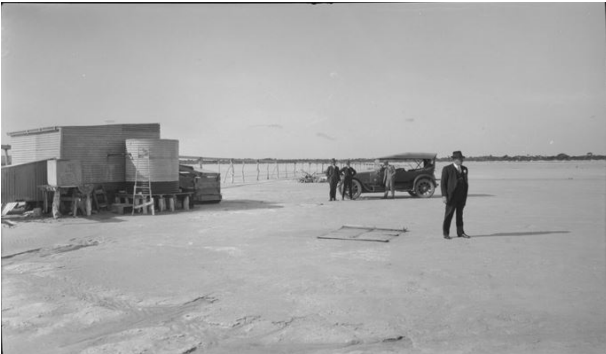
Premier Scaddan, foreground, on Pink Lake, 1915 Photograph courtesy of State Library of WA: 217001PD